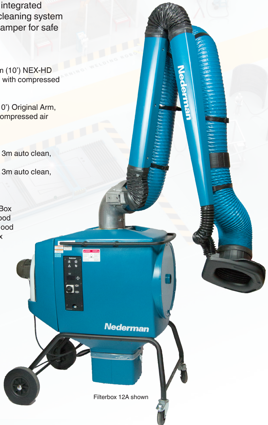
Filterbox 12A shown