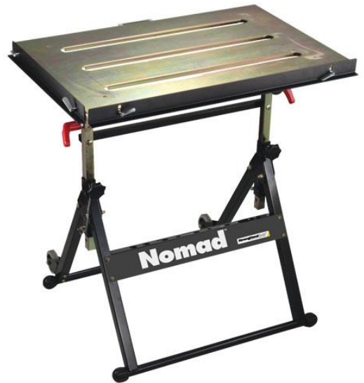
Table moves about the work area on 2 sturdy casters.

Tabletop height can be adjusted from 26" to 32" (660 – 810 mm).