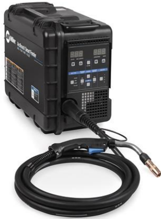
ArcReach® Smart Feeder, Bernard™ PipeWorx 300 Amp Gun Pkg 951733

ArcReach Smart Feeder system delivers excellent RMD® and Pulse MIG, MIG and Flux-Cored welding up to 200 feet away from the power source with no control cables. This system automatically shifts all controls to the Smart Feeder including weld process selection, material type and wire diameter, gas type, wire feed speed and voltage.